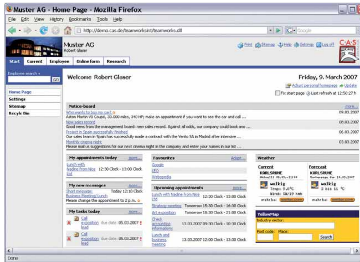
Dashboard: the most important information at a glance

“Our staff can find the information they need much faster. It means that our call centre agents are able to work very independently, and can provide the correct information straight away. This saves us up to 20 per cent in working time.”