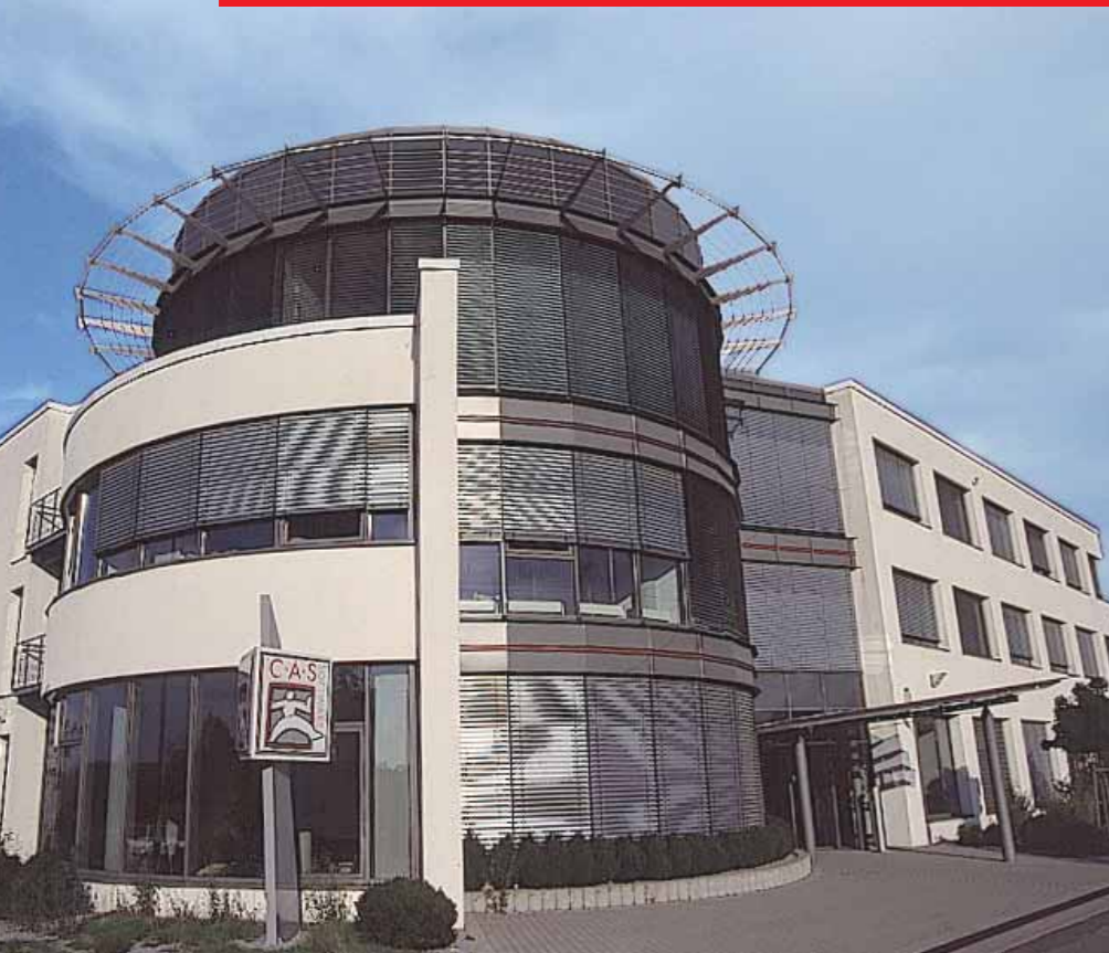
The building of CAS Software AG in the Technology Park of Karlsruhe, Germany